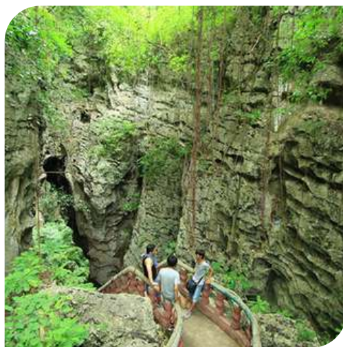
Phnom Sampeou Mountain