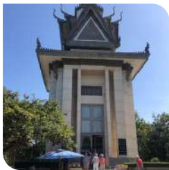
Cheung Ek Killing Field