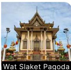
Wat Slaket Pagoda