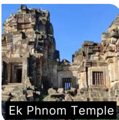
Ek Phnom Temple